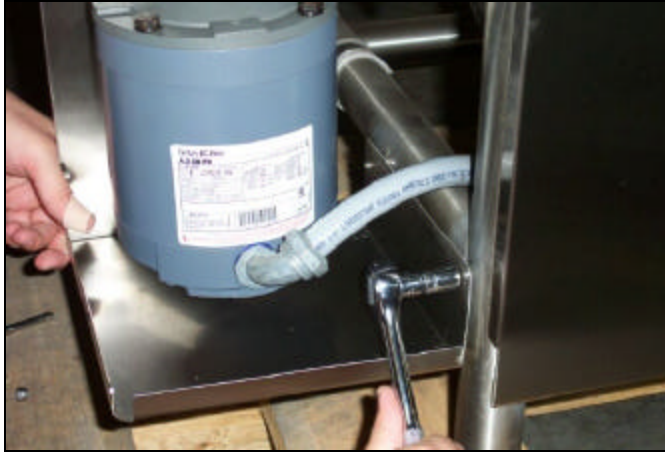
Removing the nuts securing the bottom cover.